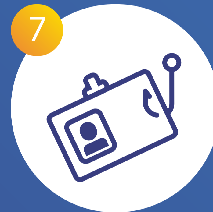
7 Account takeover fraud