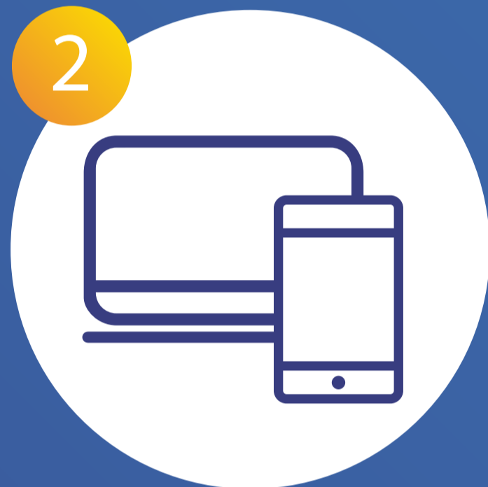
2 Managing multiple payment service providers (PSPs)