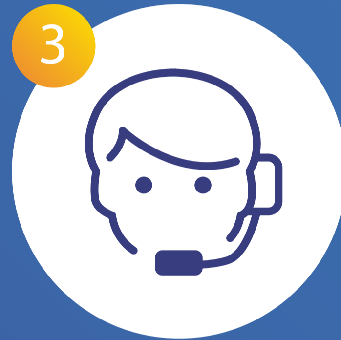
3 Processing manual orders