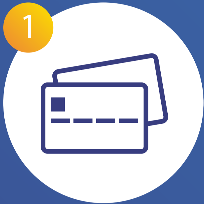
1 New card payment standards