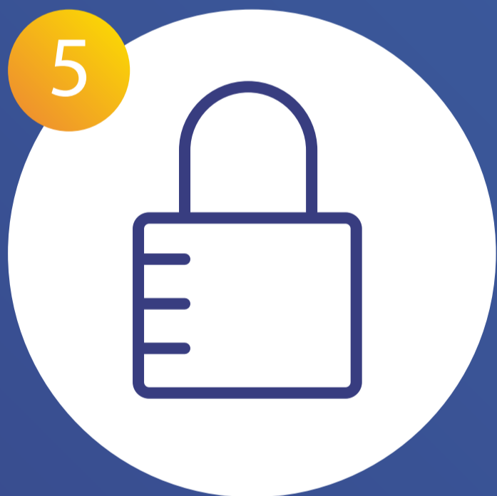
5 PCI compliance