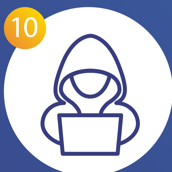
10 Credit card fraud