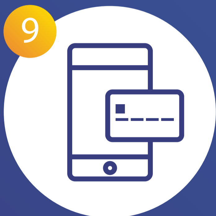
9 Mobile payment methods