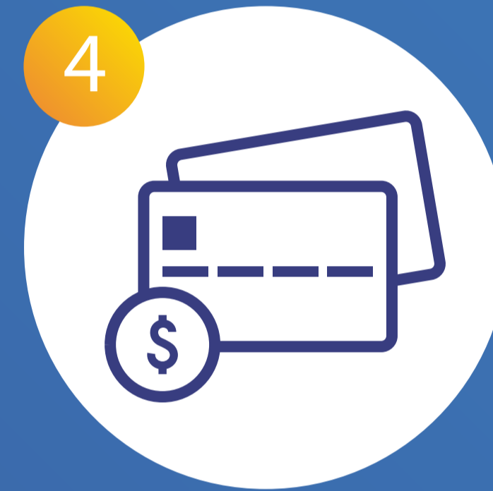
4 Credit card fees