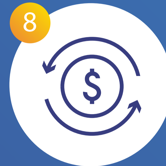
8 Chargeback management