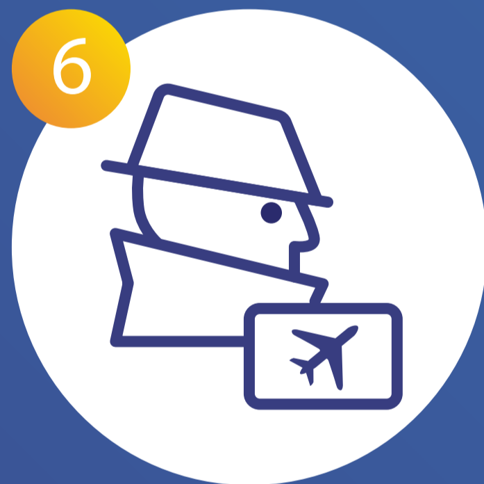
6 Loyalty program fraud