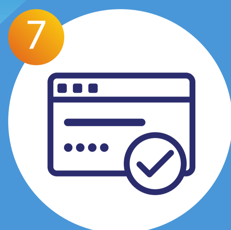
7 Out-of-wallet or In-wallet Challenge /Response Systems