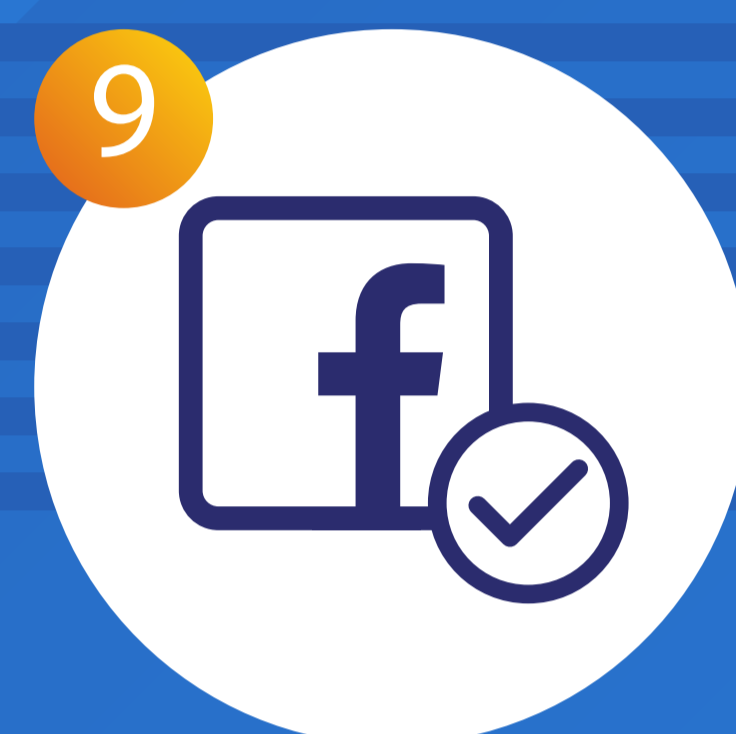
9 Social Networking Sites