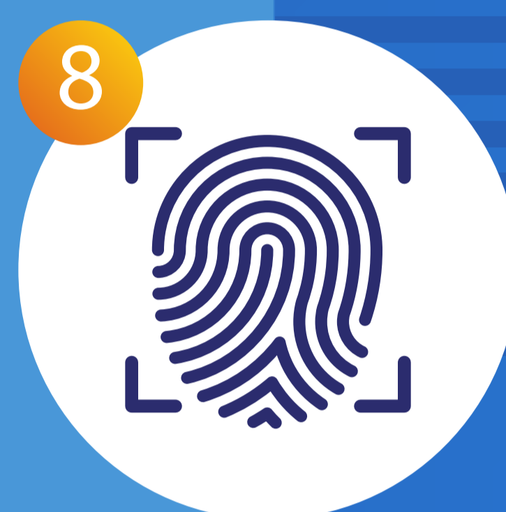
8 Biometric Indicators