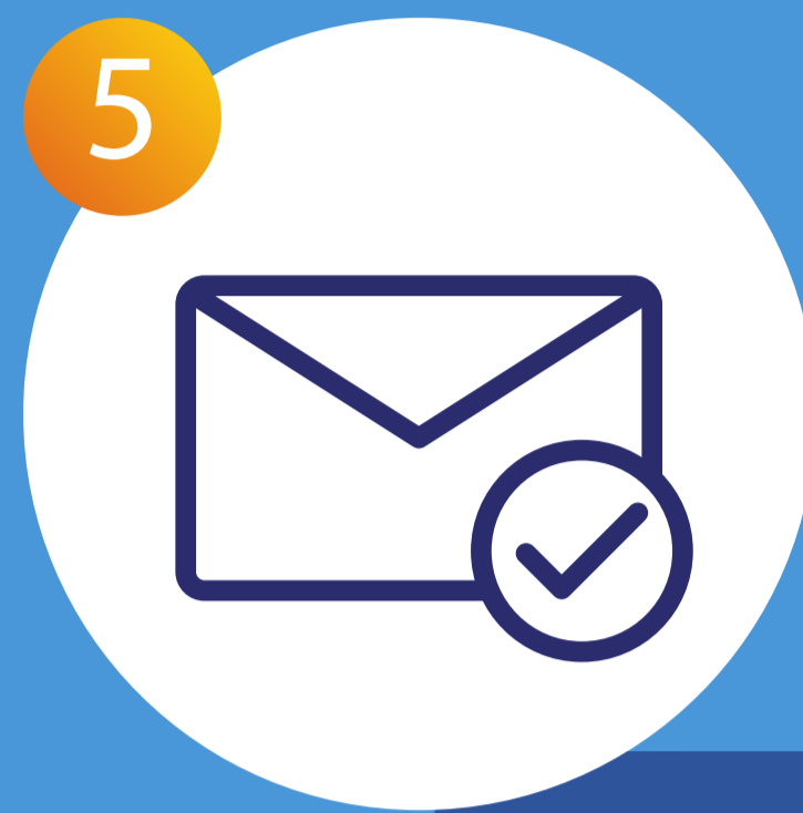
5 Postal Address Validation Services