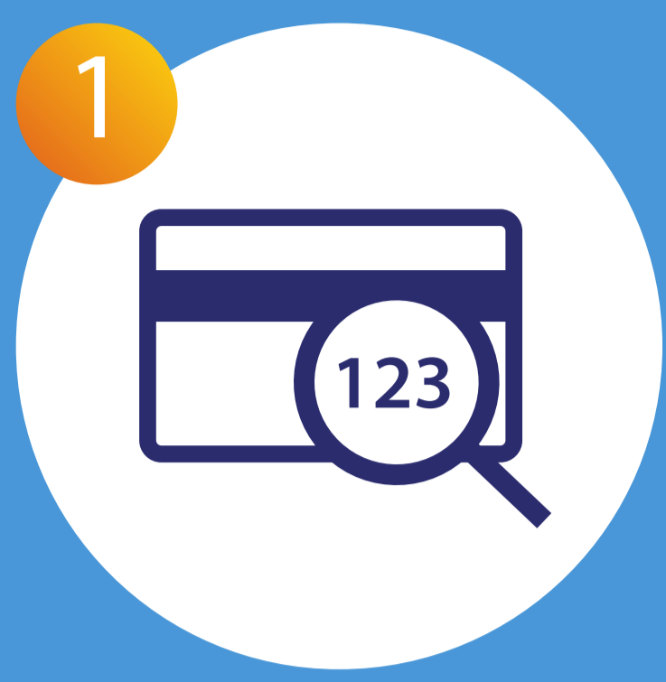
1 Card Verification Number or CVN