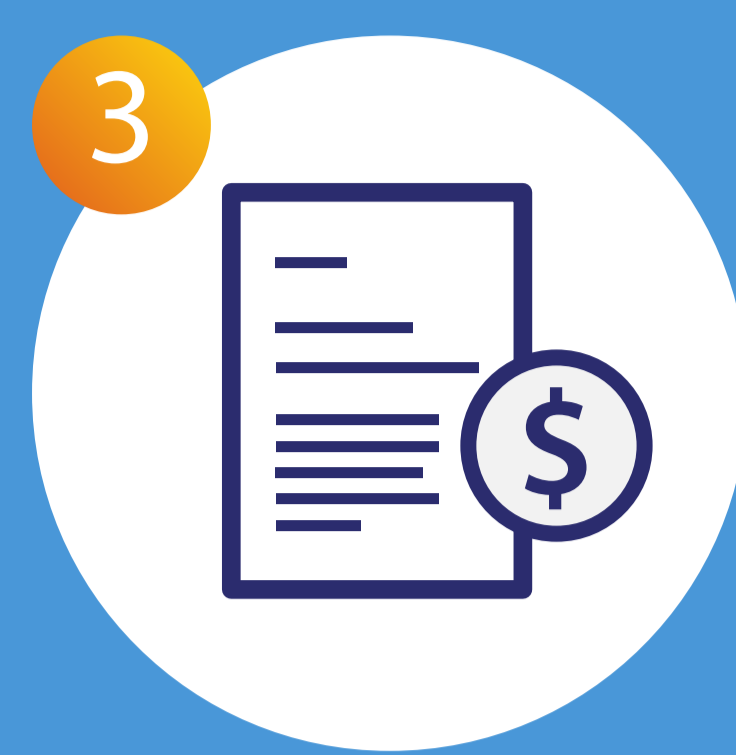
3 Paid for Public Records Services