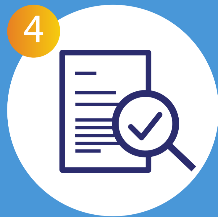
4 Credit History Check