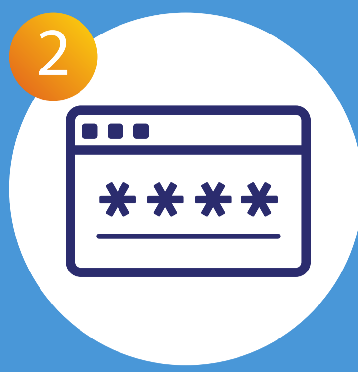
2 Payer Authentication (3D Secure)