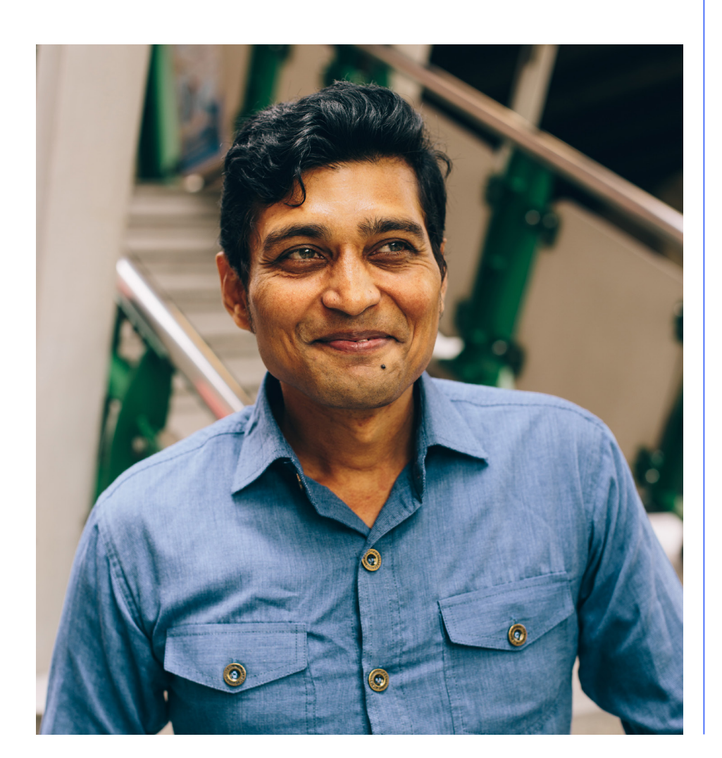
©2020 Cybersource. All Rights Reserved. Any brand name is the property of it's respective owner, is used for identification purposes only, and does not imply product endorsement or affiliation with Cybersource.

Cybersource's Payment Service for SAP Digital Payments Add-On was designed to deliver end-to-end digital payments processing simply, safely and securely.